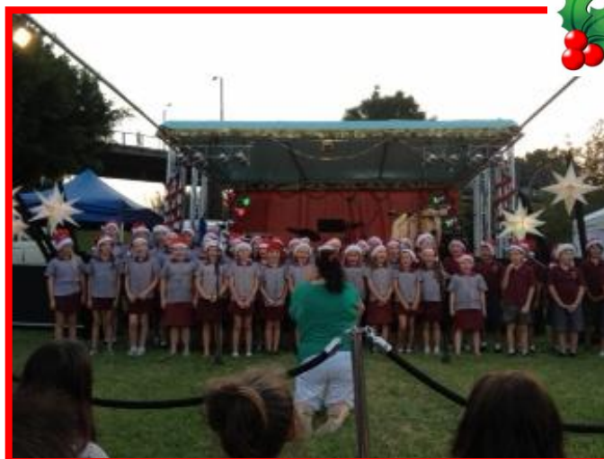
W.R.P.S CHOIR AT LISMORE CAROLS