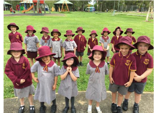
Glimpses of Term 2