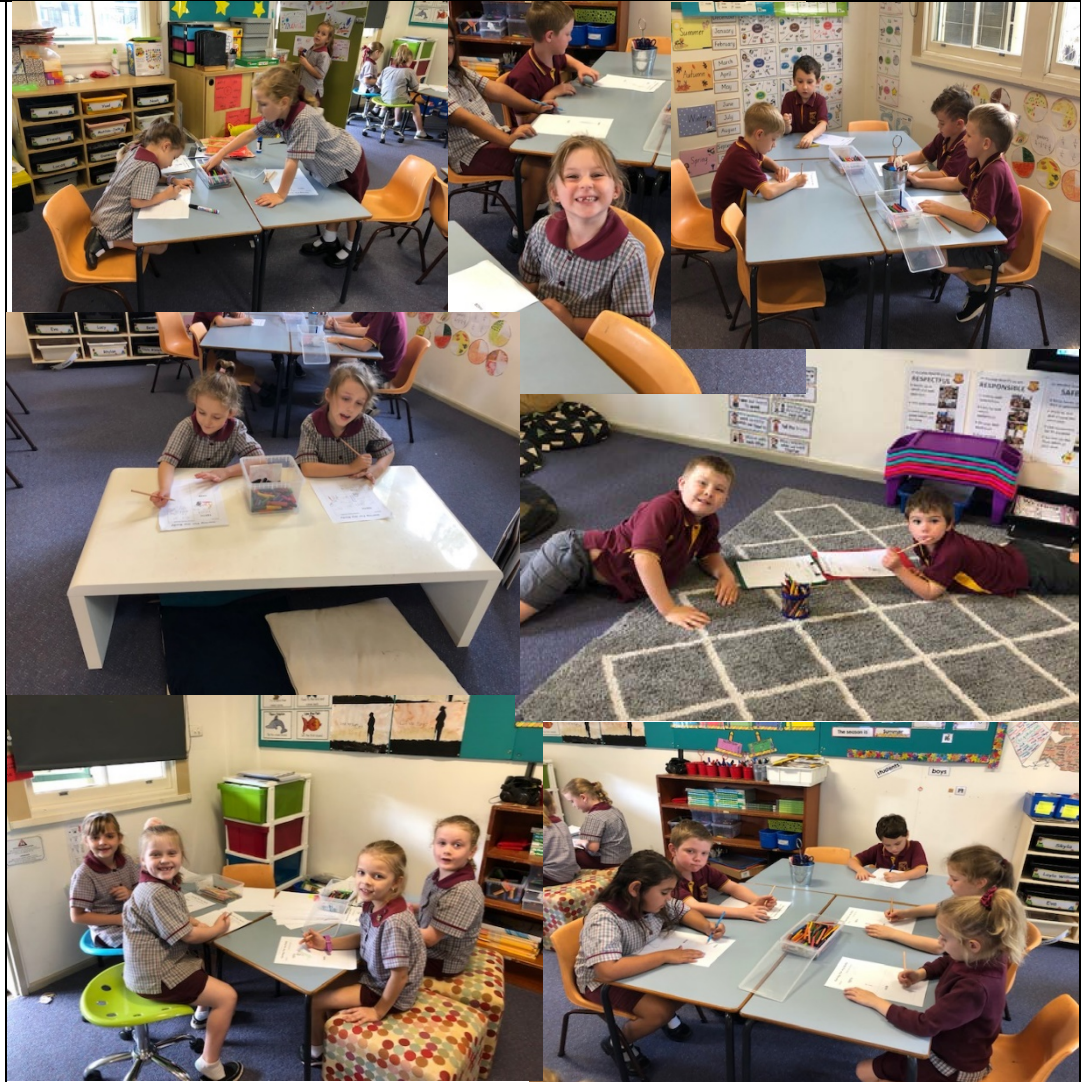
Glimpses of Term 1

If paying online does not suit, you can also pay in person at the front office (EFTPOS or cash) or write a cheque made out to Wyrallah Road Public School. Thank you to the parents that have already paid these fees, your contribution is appreciated.